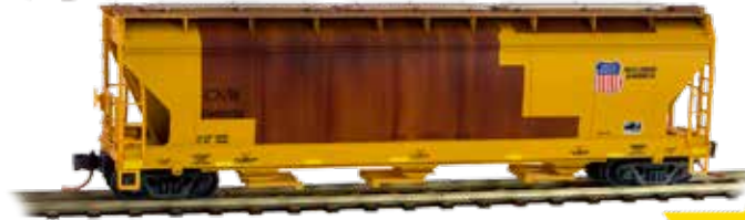
N CNW®/Union Pacific® 2-pack #094 44 410...$69.95

Contact Your Local Dealer for Availability!