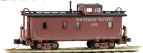
N Southern Pacific® Cattle Car Set #993 01 420...$239.95