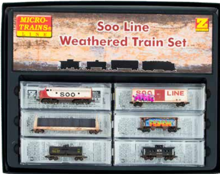
Z Soo Line Weathered Set #994 05 130...$239.95