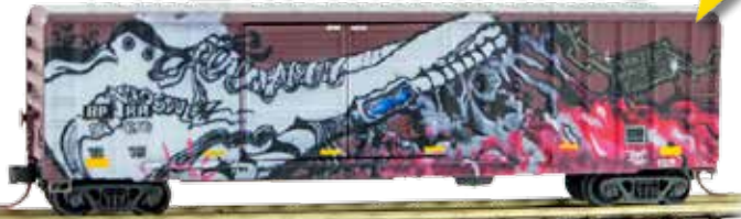
N Buffalo & Pittsburgh #030 44 290...$29.95