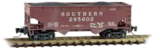
Z Southern w/Hobo tagging #533 44 120...$21.85