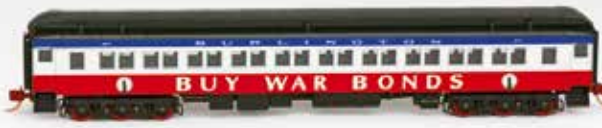
CB & Q "Buy War Bonds" Billboard Passenger Car