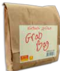
Northern Region...#995 02 202...$114.95