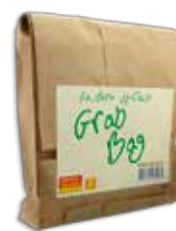
Eastern Region...#995 02 203...$114.95