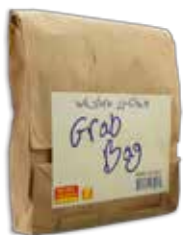
Western Region...#995 02 201...$114.95