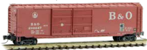
Z B&O® w/hobo tagging #506 44 330...$26.40