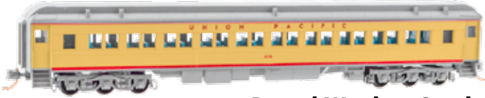
Paired Window Coach