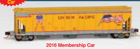
2016 Membership Car

The N Scale Enthusiast P.O. Box 30489 Savannah, GA 31410 www.NScaleEnthusiast.com