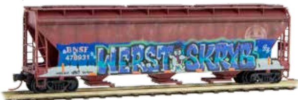
N BNSF 'Christmas' Graffiti #094 44 450...$33.90