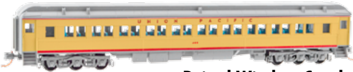
Paired Window Coach