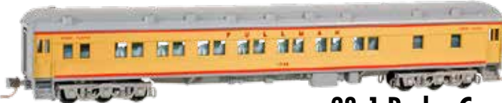
28-1 Parlor Car