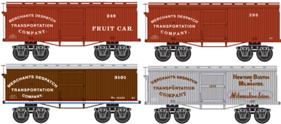
*Renderings shown for representation only.

The Merchants Despatch Transportation Co. began moving freight in 1857 and had over 1,900 reefers by 1885. In 1887 MDT built a new manufacturing facility in Despatch, NY and expanded to over 6,600 cars by 1900. Even though the MDT factory could produce up to 36 cars a day, they still occasionally purchased cars from Pullman to keep up with the growing shipping demand. This pack includes 4 prototypical cars produced by MDT.