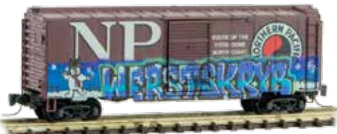
Z Northern Pacific 'Christmas' Graffiti #500 44 870...$27.25