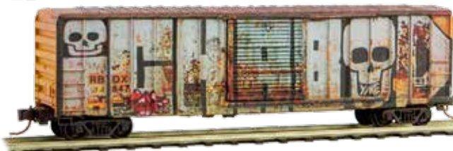
N 'Ichabod' Graffiti 3-pack #993 05 350...$94.95